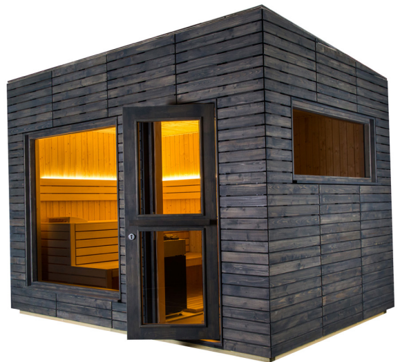
Spruce dark grey